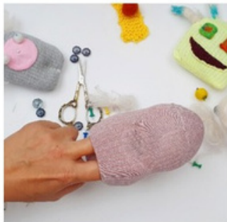
Tuck it in