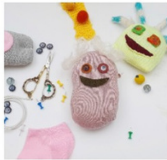
Is your monster smiling?