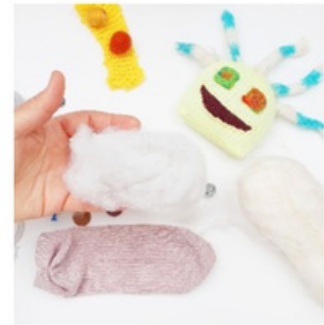
Stuff the body