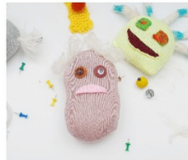
Is your Monster grumpy?