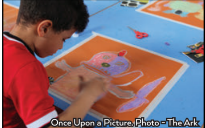
Once Upon a Picture.