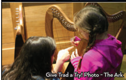
Give Trad a Try!