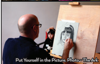
Put Yourself in the Picture.