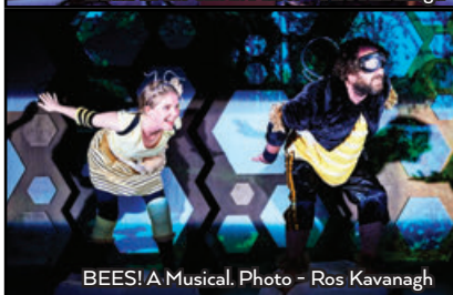
BEES! A Musical.