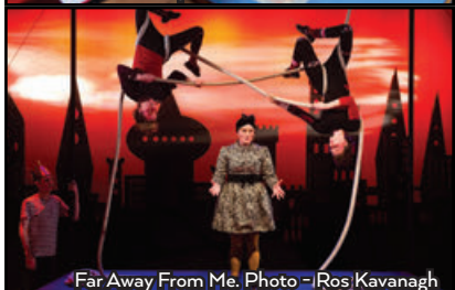
Far Away From Me.