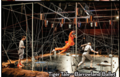
Tiger Tale - Barrowland Ballet