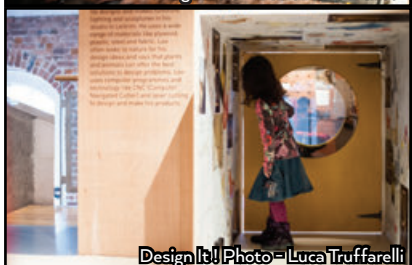
Design It!.