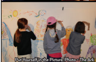
Put Yourself in the Picture. Photo - The Ark