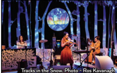
Tracks in the Snow.