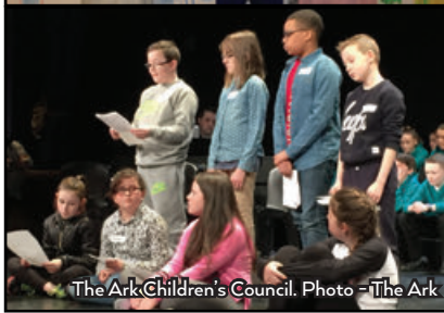
The Ark Children's Council.