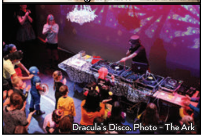
Dracula's Disco.