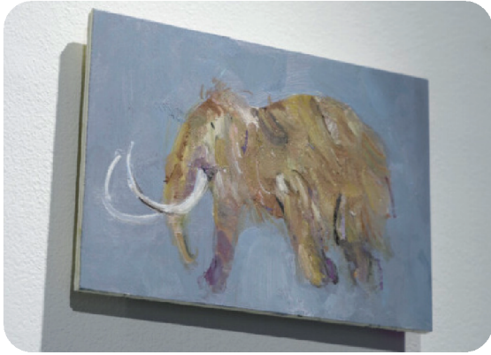
'20,000 Winters' Gabhann Dunne

Visit the Gallery floor on the 3rd floor to see the rest of the Winter Light exhibition.