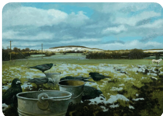
'Winter Feed' Martin Gale

What's happening in this painting? Can you name all of the animals in this image? What do you think the weather feels like in this scene? Have you ever seen these birds in your garden or local park? Do you ever feed the birds in winter?