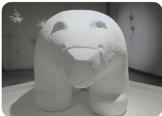
'Under the Aurora Borealis' Helen O'Connell

What do you know about polar bears? Where do you think they live? This sculpture is made of marble, think about the texture of the stone, do you think it is hard or soft? Warm or cold? How long do you think it took the artist to make? What kind of personality might Oomka have?